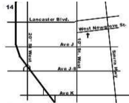
† =Location of Grace Lutheran Church & School